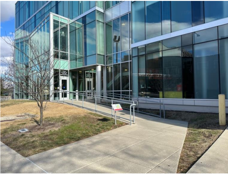
Image Description: A concrete access ramp leads upward towards the building entrance. The entrance is a glass door with an automatic button to the right side at the top of the ramp.