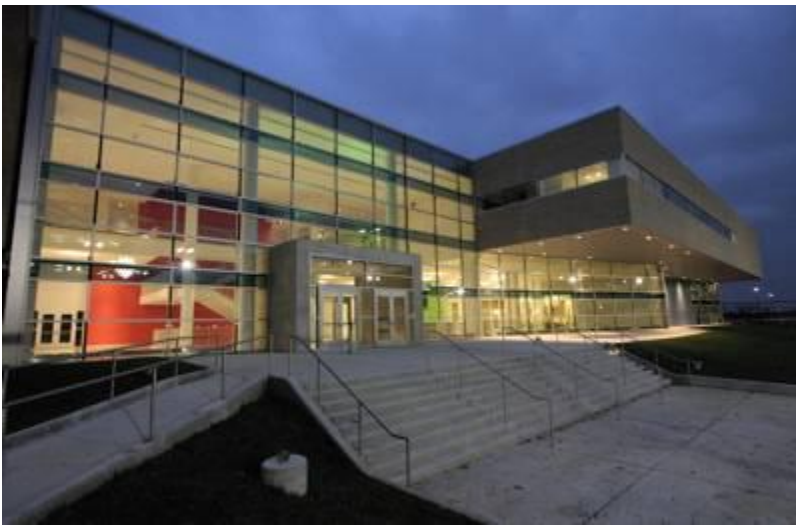
Image Description: The Norris Street entrance to Tyler, a building with glass windows. There is a cement ramp leading up to the building entrance on the left side and cement stairs.

The Norris Street entrance to Tyler is considered the main entrance and is on Norris Street between 12th and 13th Streets . Entering on the Norris Street, there is a ramp for easy access on the left side of the entrance (closer to 13 th St.) Once in front of doors there is an access button to press and the first doors will open, once inside, there is another access button to press to open the second set of doors.