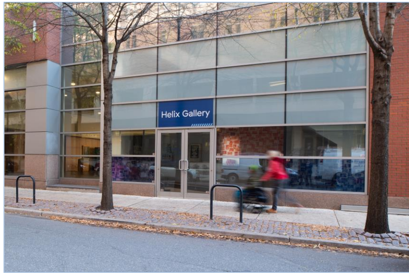
Helix Gallery, Thomas Jefferson University

The Institute on Disabilities at Temple University and Thomas Jefferson University welcome you to FILE/LIFE . We hope the following information will help you plan your visit.