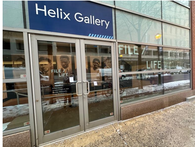
Helix Gallery, Locust Street doors. Not an entrance.