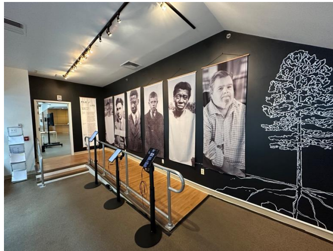
Interior of Helix Gallery